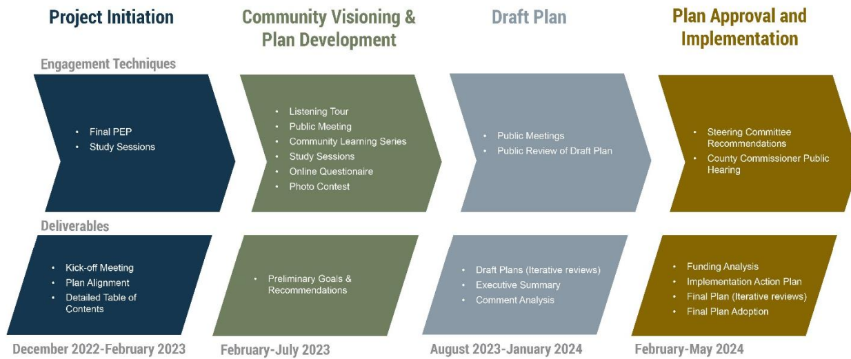
Figure 1: Engagement Timeline